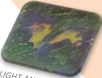
LIGHT AND DARKNESS S