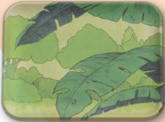
G OD RESTED

Place the pictures from the story of creation in order by entering the red letter from each picture in the correct sequence blocks below.