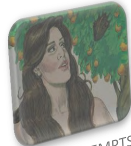
SERPENT T EMPTS EVE