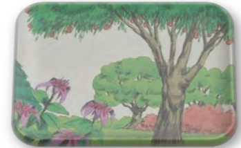
LAND, SEAS, VEGETATI O N