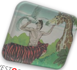
LIVEST O CK AND MAN