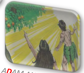
A DAM AND EVE SIN

Example: This is the first event in the story. Copy the letter A to Block 1.