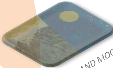
SUN AND MOON