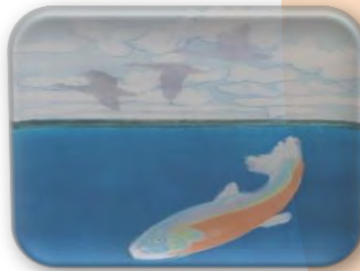
F ISH AND FOWL