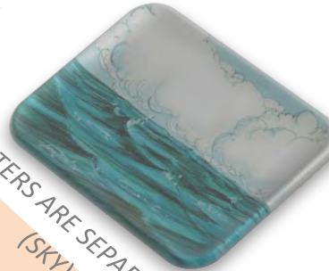
W ATERS ARE SEPARATED (SKY)