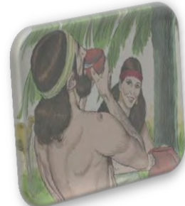
ABRAHAM'S SERVANT M EEETS REBEKAH