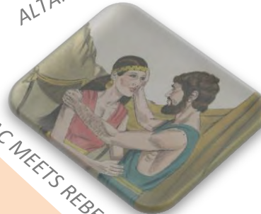
ISAAC M EETS REBEKAH