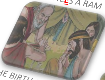
THE BIRTH OF ISAAC IS P REDICTED