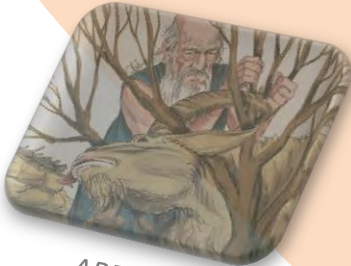
ABRAHAM S ACRIFICES A RAM