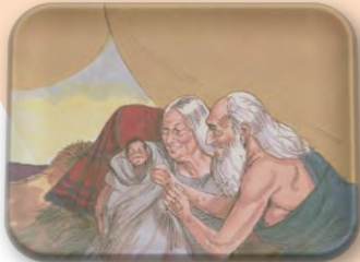
ISAAC IS B ORN

Place the pictures from the story of Isaac's life in order by entering the red letter from each picture in the correct sequence blocks below.