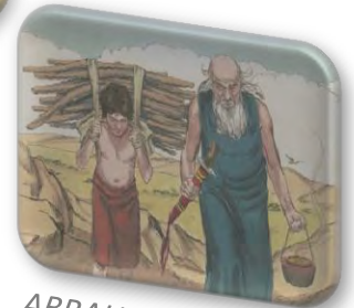
ABRAHAM MAKES J OURNEY TO SACRIFICE ISAAC

Example: This is the first event in the story. Copy the letter A to Block 1.