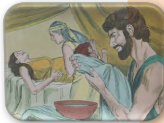
JACOB AND ESAU A RE B ORN