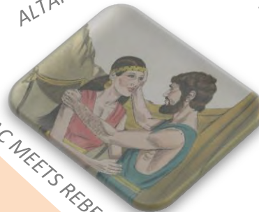
ISAAC M EETS REBEKAH