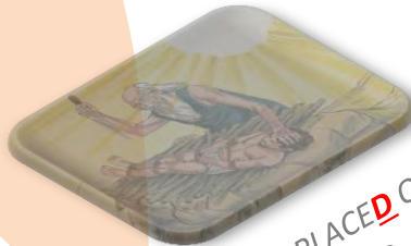
ISAAC IS PLAC E D ON AN ALTAR