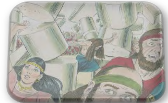
SAMSON DESTROYS P HILISTINE TEMPLE AND DIES