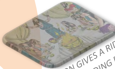
SAMSON GIVES A RIDDLE AT HIS W EDDING PARTY