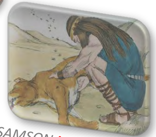
SAMSON K ILLS A LION AND EATS HONEY

Example: This is the first event in the story. Copy the letter E to Block 1.