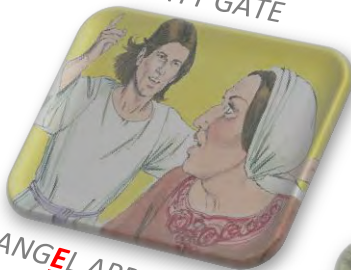
ANG E L APPEARS TO MANOAH & HIS WIFE