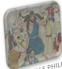
SAMSON KILLS PHILISTINES WITH DONKEY J AWBONE