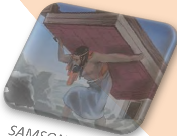
SAMSON REMO V ES CITY GATE