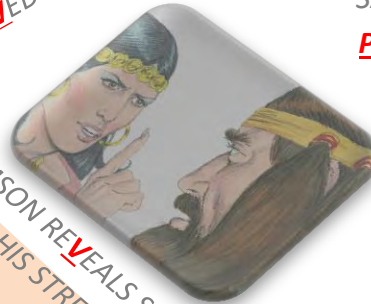
SAMSON RE V EALS SECRET OF HIS STRENGTH