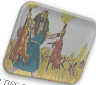
SAMSON TIES TO R CHES TO FOXES